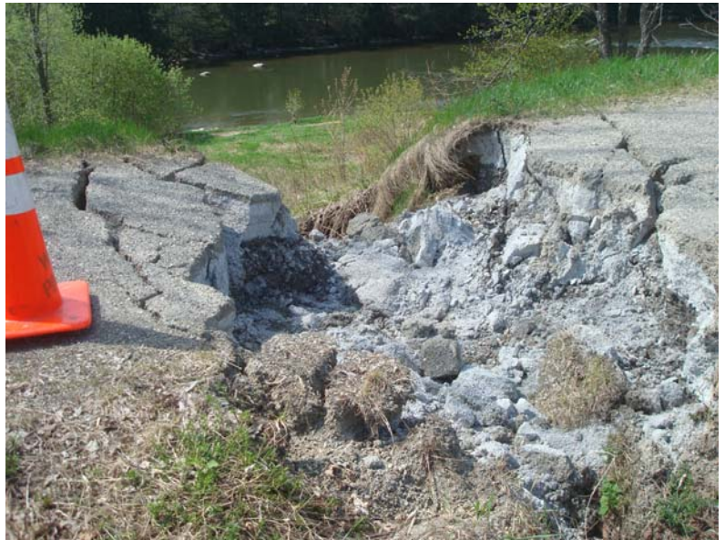
A failed culvert beneath the MVRT closed the Trail for a couple of weeks in May