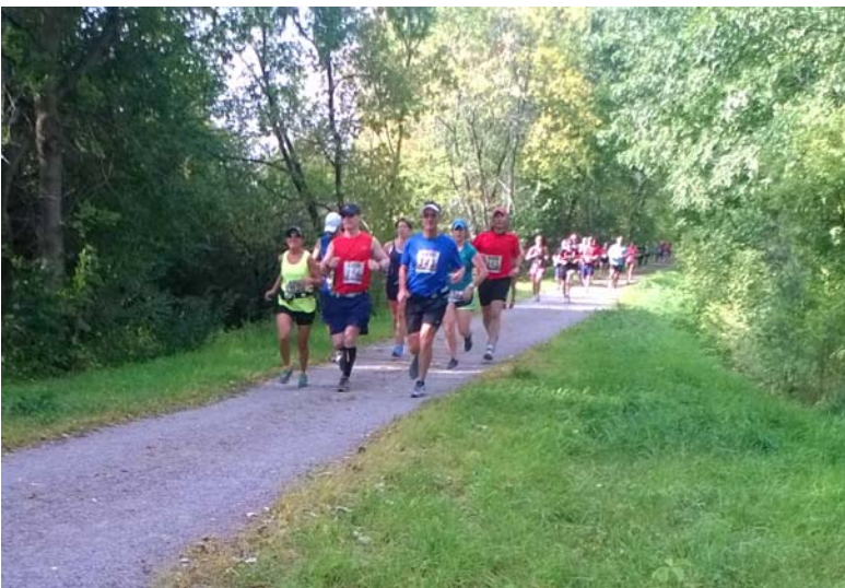
Participants in the half-marathon during St. Albans Raid celebrations